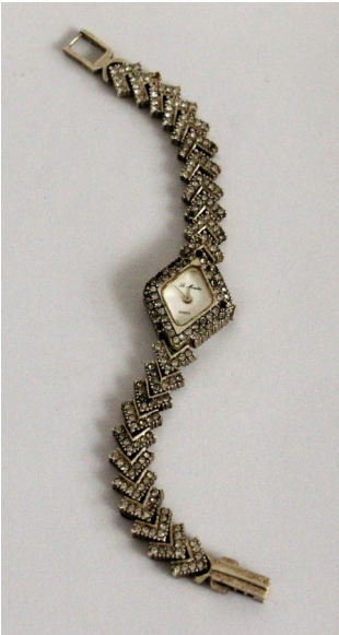
Best Costume Blingy Watch Kevin Bean