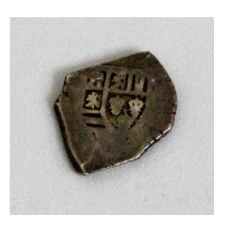
Best Coin Piece of Eight Eric Figueroa